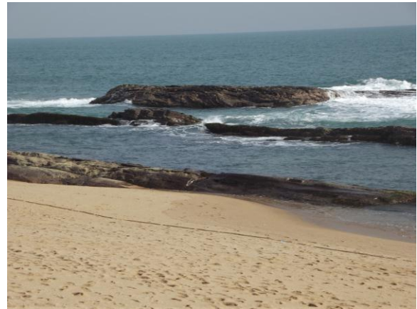
One of the Beaches at Cape Coast

Another reason for rejoicing is the refreshment God has given us when we needed it most. After a challenging year, God provided us the opportunity to attend a mission retreat in Cape Coast. What a lovely time to meet other missionaries and enjoy the beauty of God's creation!!