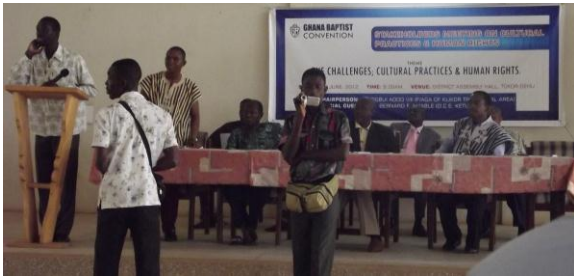
The Forum on Traditional Practices & Human Rights