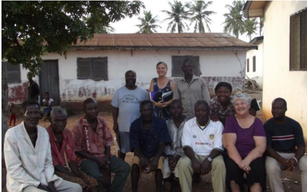
Avakpedorme Shrine Where We Met Opposition

We did visit one shrine recently that was not quite as hospitable. As soon as we opened our Bibles, some of the men started protesting. It was clear Satan did not want them to hear God's Word. After much discussion, we were able to present the gospel without reading directly from the Bible. Despite the rocky start, the meeting ended very amicably with an invitation to return.