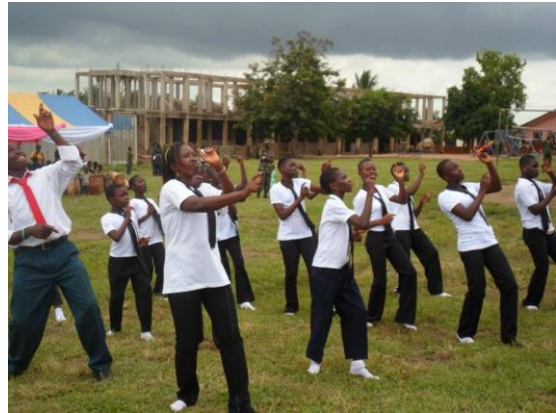
Choreographed Dance by Children at Haven of Hope